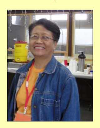
O KAHAKU O KA PU'U WAI