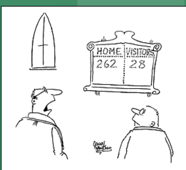
"There must be another way to record attendance for our services."