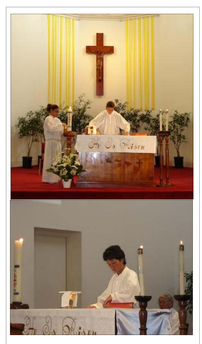
The altar is prepared by the altar servers during the preparation of gifts.

do have implications for the flow of the liturgy. This matter should be carefully planned by each parish, to safe-guard the collection, to protect the reputation of anyone handling the collection, and to be good stewards of the money collected for the Lord's work.