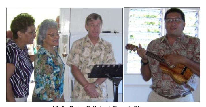
Malia Puka O Kalani Church Singers.

"do" the liturgy. As a place of active engagement, the liturgy insists that its music be tuned to every voice. At a diocesan assembly recently, the people singing the responses soon realized that a delegation of people representing the ministry to the deaf were following the responses not by singing, but by signing. The synchronized movements of their arms and hands were a powerful reminder that no one is a passive spectator at worship.