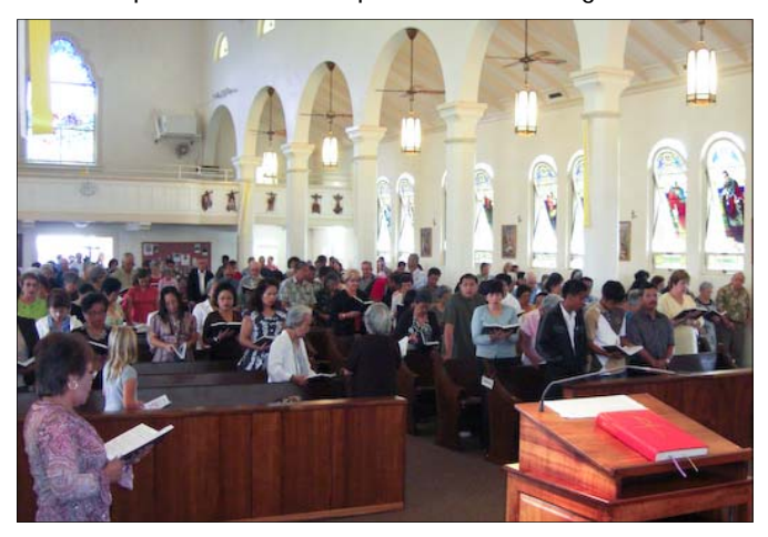
Music Singing the Liturgy continued from page 2

Years ago, my childhood pastor had a distinctive hobby: birdcalls. He was remarkably adept at imitating the distinctive sounds of an entire menagerie.