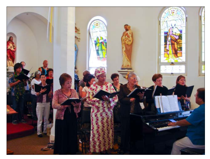
St. Joseph Choir leads the parishioners in song at Mass.