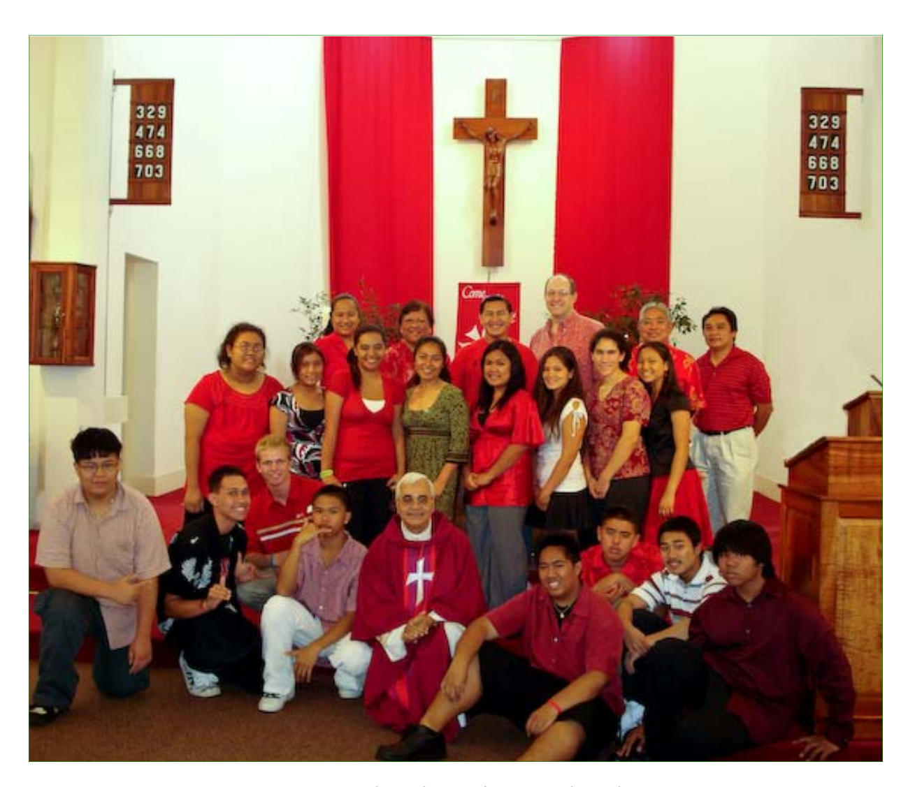
St. Joseph Church Youth Choir!

Phone: (808) 935-9338 Office Hours: 8:00 am - 12:00 Noon