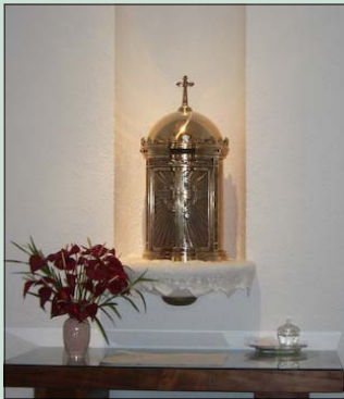
Tabernacle Blessing The refurbished tabernacle was blessed on May 16 at the 6:00 am Friday Mass.