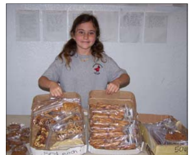
Elementary May Day St. Joseph Elementary held a May Day celebration on May 9. A fantastic program was held in the Walter Victor gymnasium followed by a Fun Fair on the elementary campus.