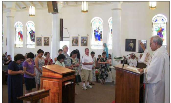
Catechists receive a special blessing at the 11:30 am Mass on 5/18/08

The R.C.I.A. classes officially concluded on Monday, May 19, 2008. Our next classes will begin August of 2008. Anyone who is interested in becoming a Catholic or learning more about the Catholic faith is encouraged to call me for more information about this program.