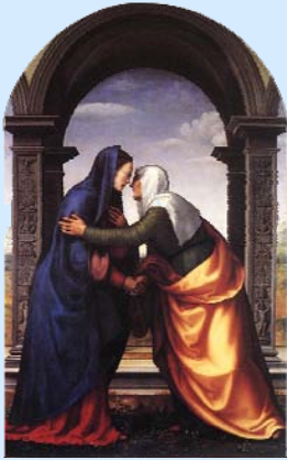
Blessed art thou among women and blessed is the fruit of thy womb, Jesus!