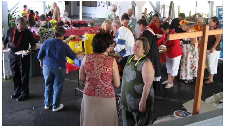
Mahalo to all those who gifted us with their time, talents and treasure in their preparations for our Mothers Day Celebration at Malia Puka O Kalani Church .