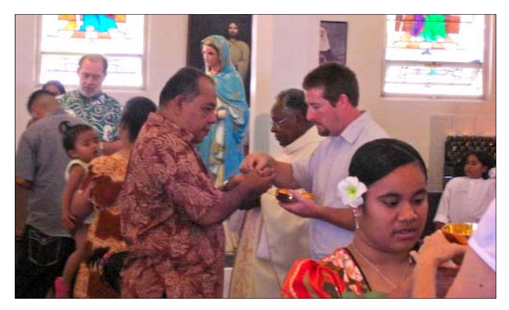
Full Conscious Active Participation continued from page 2

At the heart of the Communion rite is the procession to the table: a line unlike any other for by it we trace the pattern of our life's journey, close to one another, moving together towards the heavenly banquet. Often, we sing a psalm or hymn that draws us more deeply into the meaning of our action.