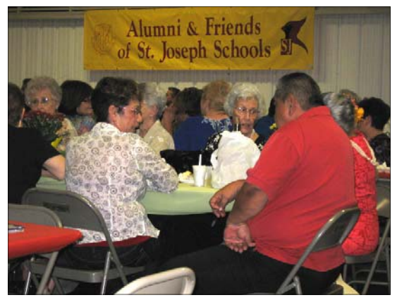
Luau Fun! Alumni and Friends of St. Joseph Schools