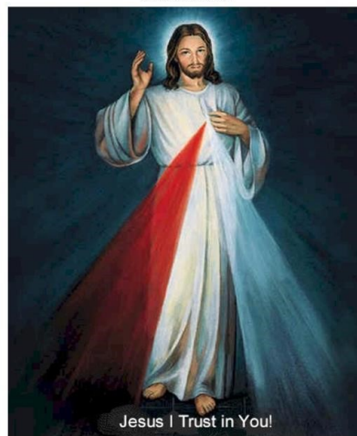
Jesus | Trust in You!

"Say unceasingly the chaplet that I have taught you. Whoever will recite it will receive great mercy at the hour of death."