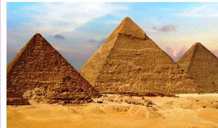
The Great Pyramids, Egypt