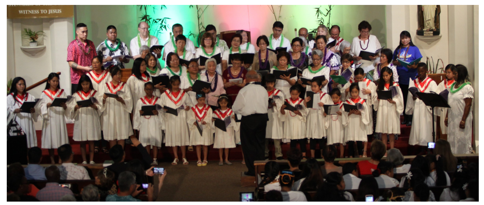
Centennial Concert of Choirs: March 22, 2019