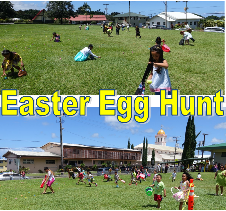
Thank you to all the wonderful people who donated treats & plastic eggs. We collected over 3,000 eggs this year, 2x more than last.