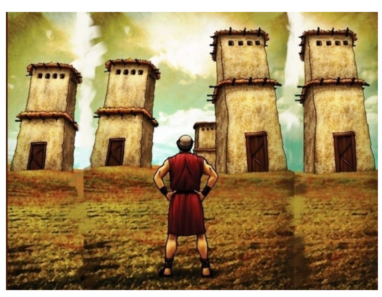
Then he said to them, "Watch out! Be on your guard against all kinds of greed; life does not consist in an abundance of possessions." -Luke 12:15