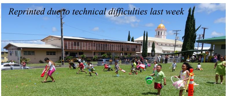
Thank you to all the wonderful people who donated treats & plastic eggs. We collected over 3,000 eggs this year, 2x more than last.