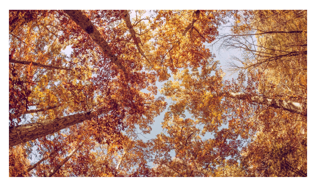
30th Sunday in Ordinary Time - 2021