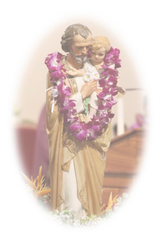
Please remember St. Joseph Parish in your will!

5 pm Saturday Vigil Mass 7 am, 9 am, 11:45 am and 6 pm Sunday