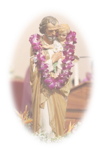
Please remember St. Joseph Parish in your will!

5 pm Saturday Vigil Mass 7 am, 9 am, 11:45 am and 6 pm Sunday