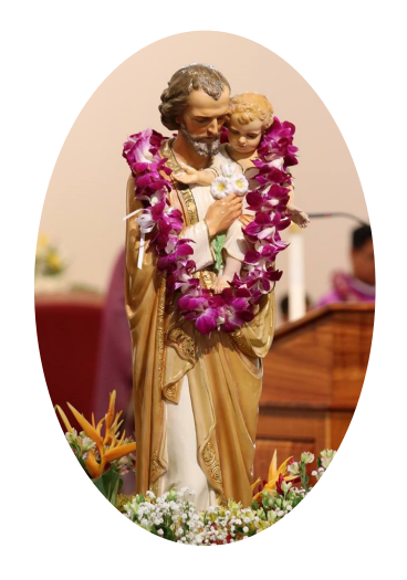
Please remember St. Joseph Parish in your will!

5 pm Saturday Vigil Mass 7 am, 9 am, 11:45 am and 6 pm Sunday