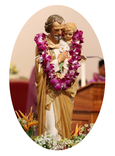
Please remember St. Joseph Parish in your will!

5 pm Saturday Vigil Mass 7 am, 9 am, 11:45 am and 6 pm Sunday