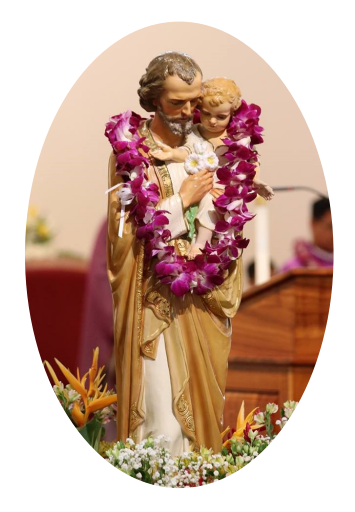
Please remember St. Joseph Parish in your will!

5 pm Saturday Vigil Mass 7 am, 9 am, 11:45 am and 6 pm Sunday