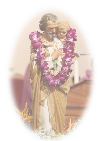
Please remember St. Joseph Parish in your will!

5 pm Saturday Vigil Mass 7 am, 9 am, 11:45 am and 6 pm Sunday