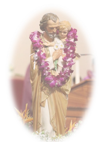
Please remember St. Joseph Parish in your will!

5 pm Saturday Vigil Mass 7 am, 9 am, 11:45 am and 6 pm Sunday