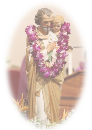
Please remember St. Joseph Parish in your will!

5 pm Saturday Vigil Mass 7 am, 9 am, 11:45 am and 6 pm Sunday