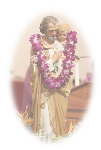
Please remember St. Joseph Parish in your will!

5 pm Saturday Vigil Mass 7 am, 9 am, 11:45 am and 6 pm Sunday