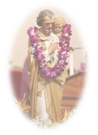
Please remember St. Joseph Parish in your will!

5 pm Saturday Vigil Mass 7 am, 9 am, 11:45 am and 6 pm Sunday