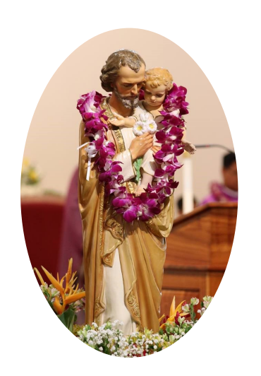
Please remember St. Joseph Parish in your will!

5 pm Saturday Vigil Mass 7 am, 9 am, 11:45 am and 6 pm Sunday