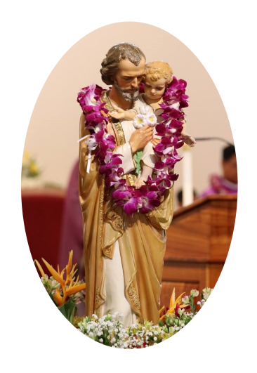
Please remember St. Joseph Parish in your will!

5 pm Saturday Vigil Mass 7 am, 9 am, 11:45 am and 6 pm Sunday